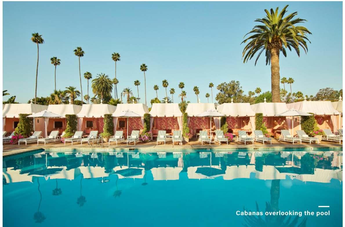
Cabanas overlooking the pool

The two spectacular Presidential 'ultra' Bungalows are the most prestigious presidential suites in Los Angeles. Each three-bedroom bungalow blends the indoor and outdoor experience effortlessly through 464m 2 /5,000ft 2 of living space. They feature a spacious great room with 4m/12ft cottage-style ceiling, chef's kitchen, expansive outdoor living area, outdoor fireplace and shower, and a wall of floor-to-ceiling glass doors overlooking a private infinity plunge pool.