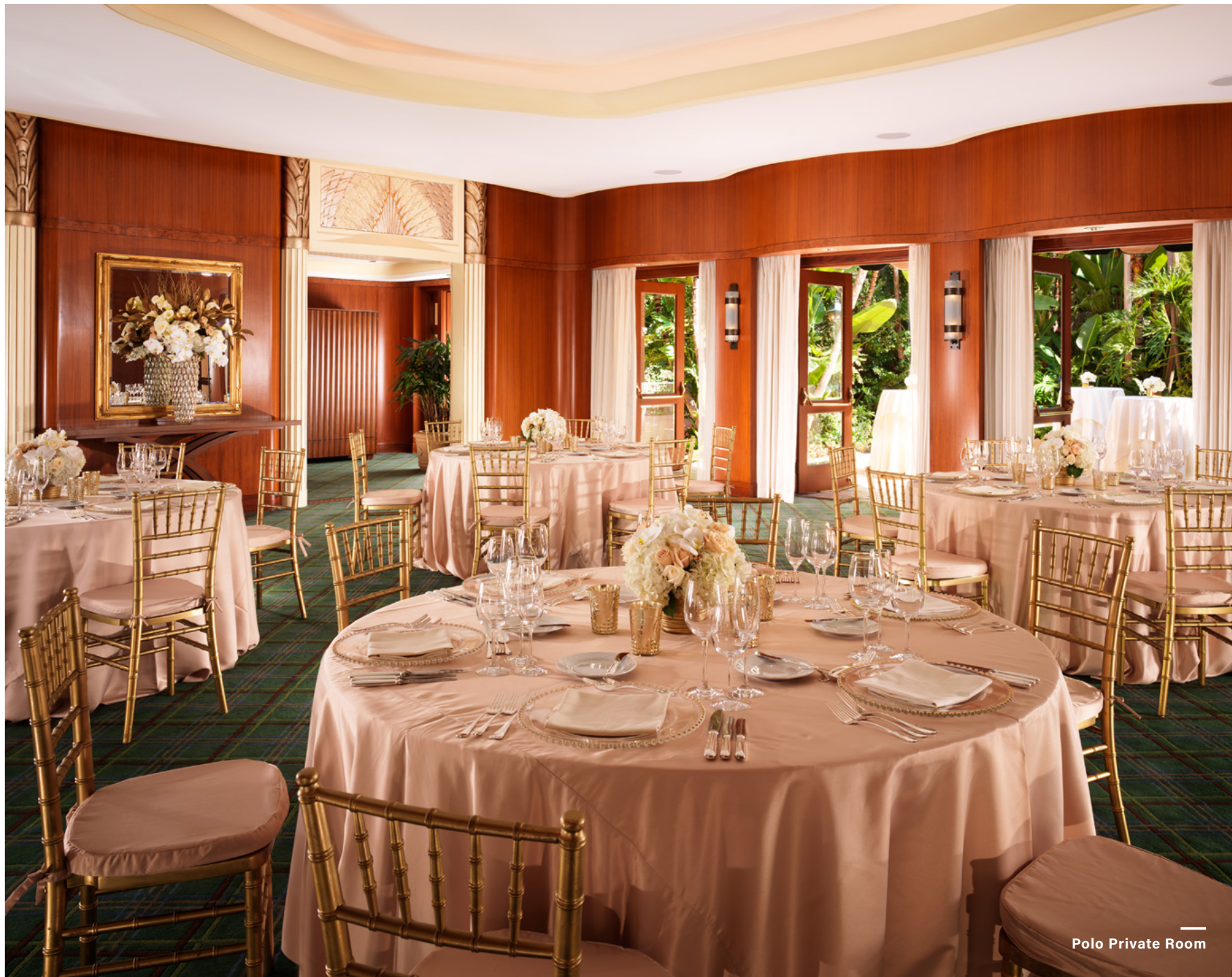
Polo Private Room