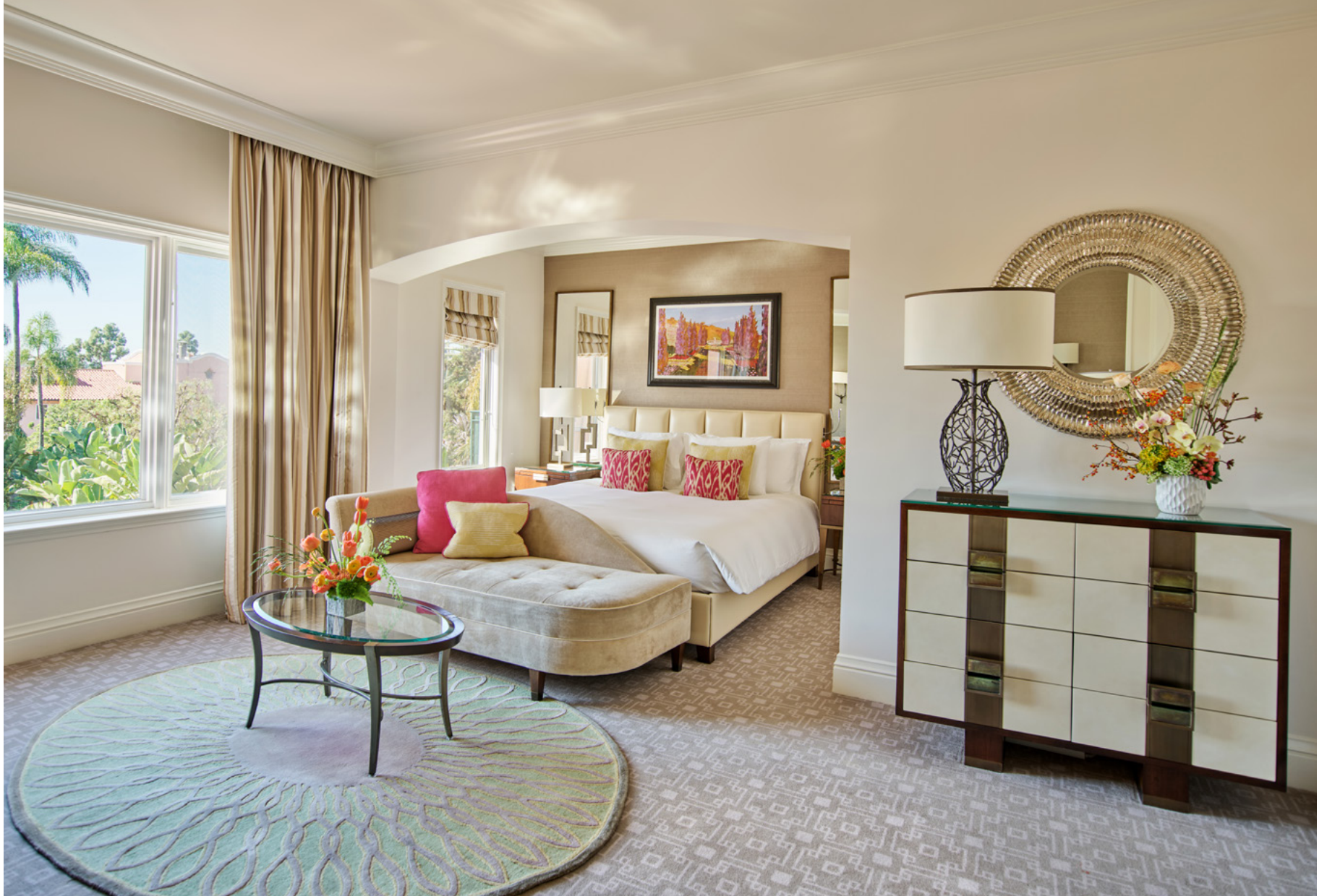
— Deluxe Room