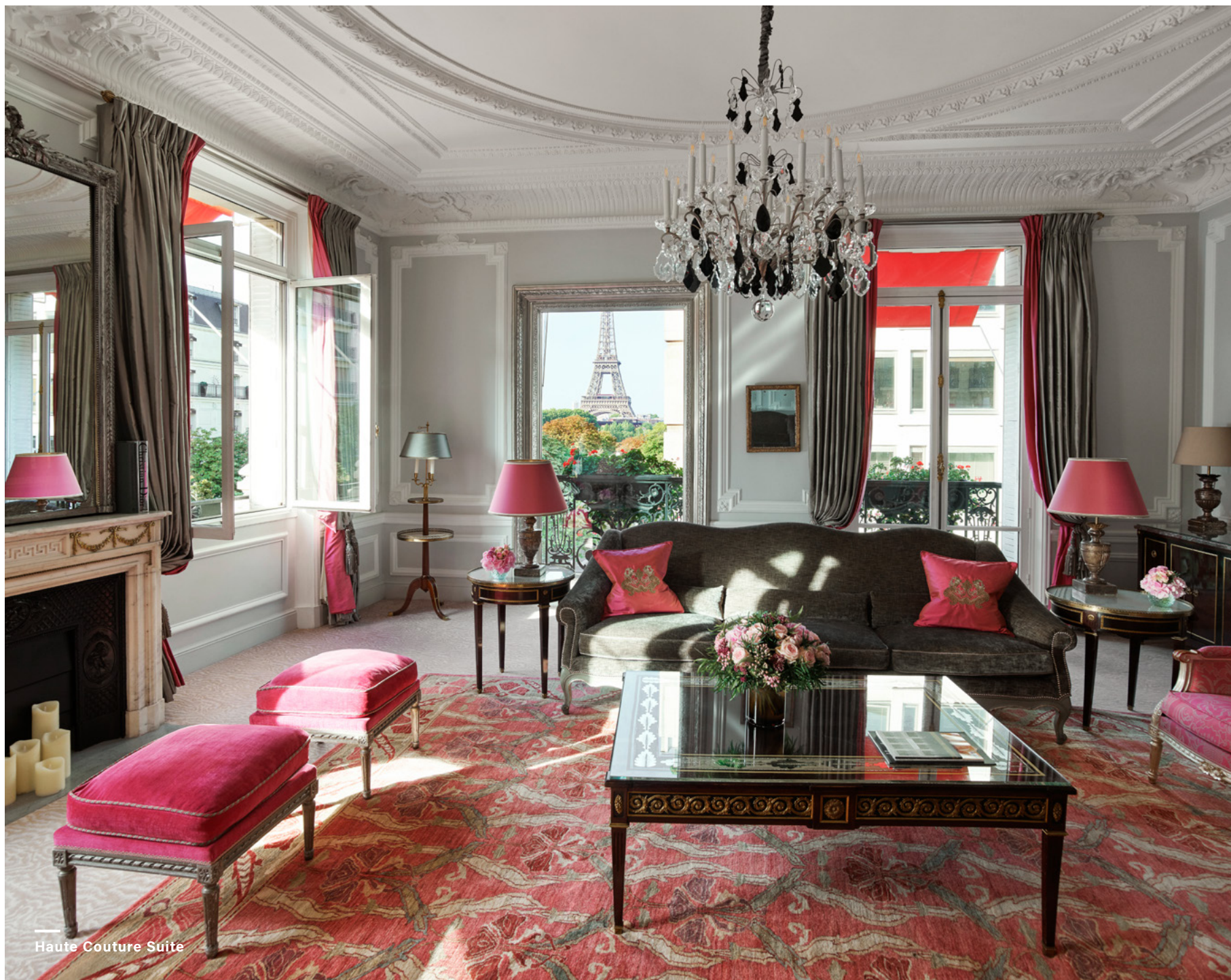
Haute Couture Suite