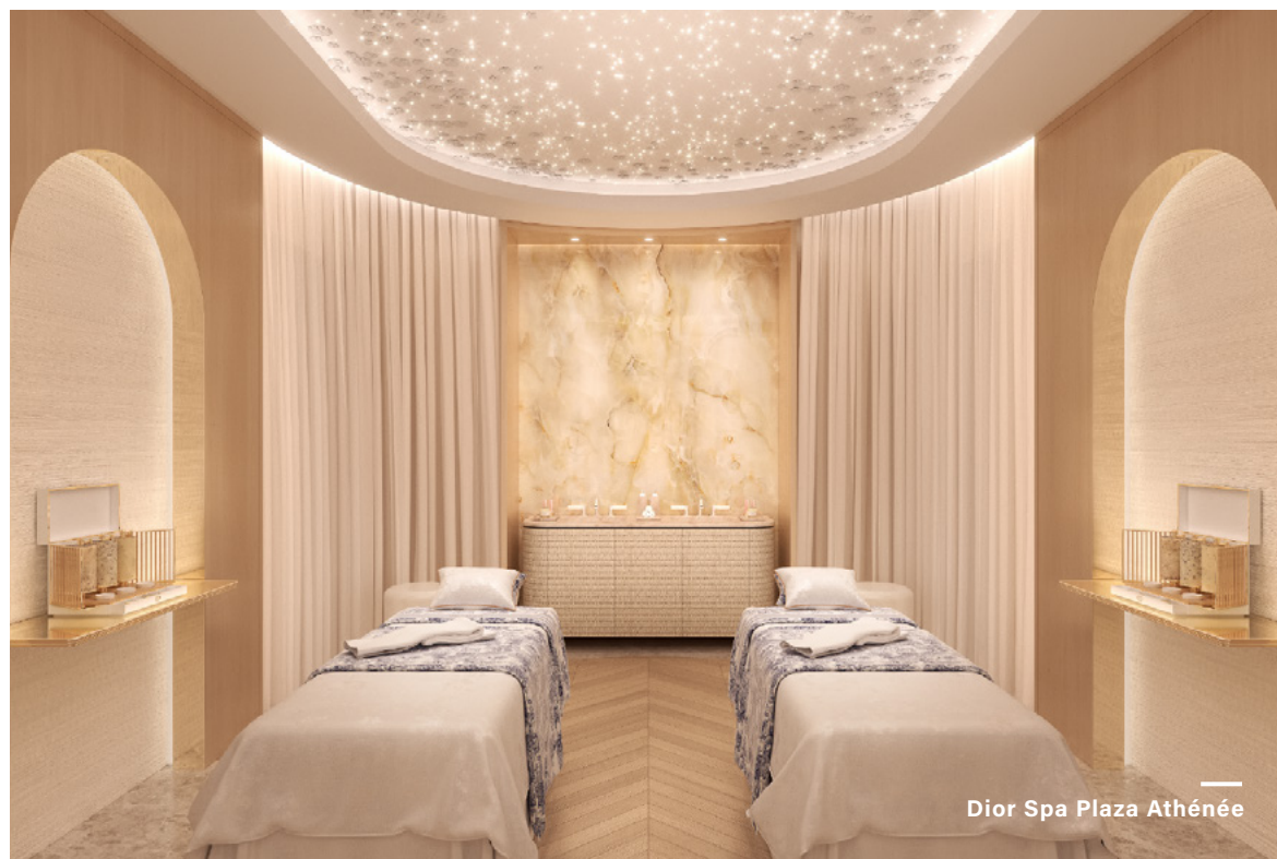
Dior Spa Plaza Athénée

The spirit of Haute Couture lives on in every personalised, hand-tailored detail of this suite. High ceilings grace every room, while a breathtaking view of the Eiffel Tower is framed by the tall living room windows.