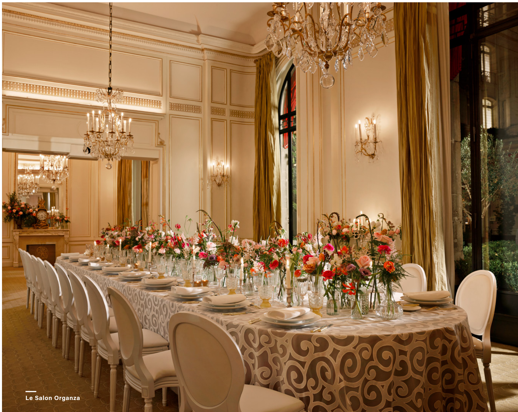
Le Salon Organza