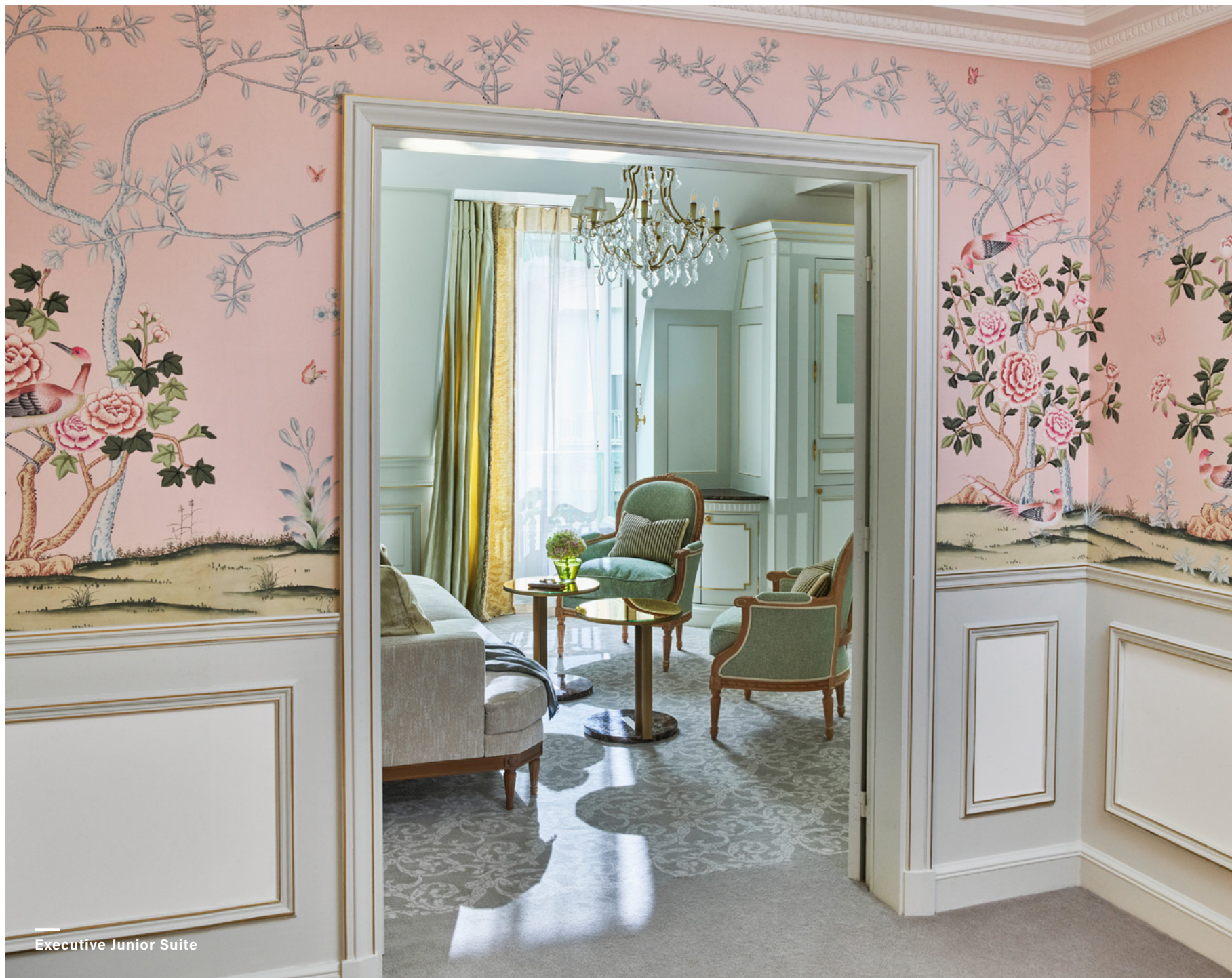
Executive Junior Suite