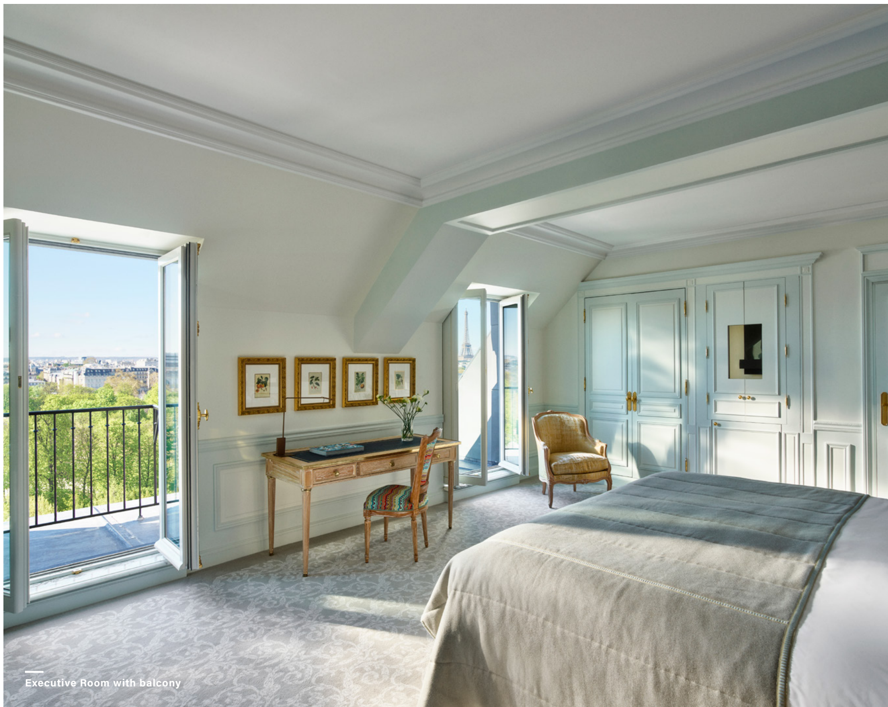
Executive Room with balcony